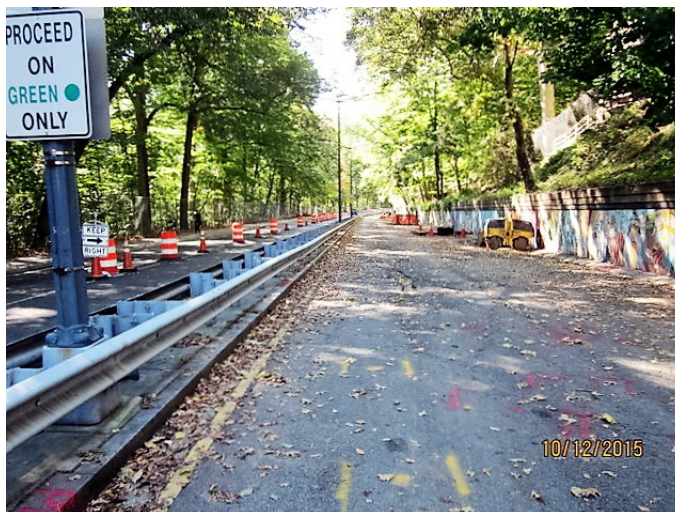
The two westbound lanes of Klinge Road, between Adams Mill Road and the Beach Drive turnoff.