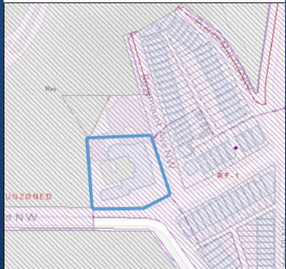
Map from the Office of Planning