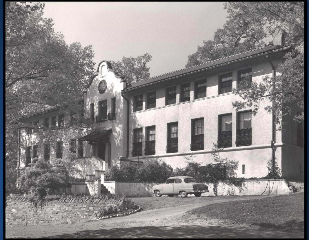
Ca. 1955, Photo by George Kalec Courtesy of Rosemount Center Archives